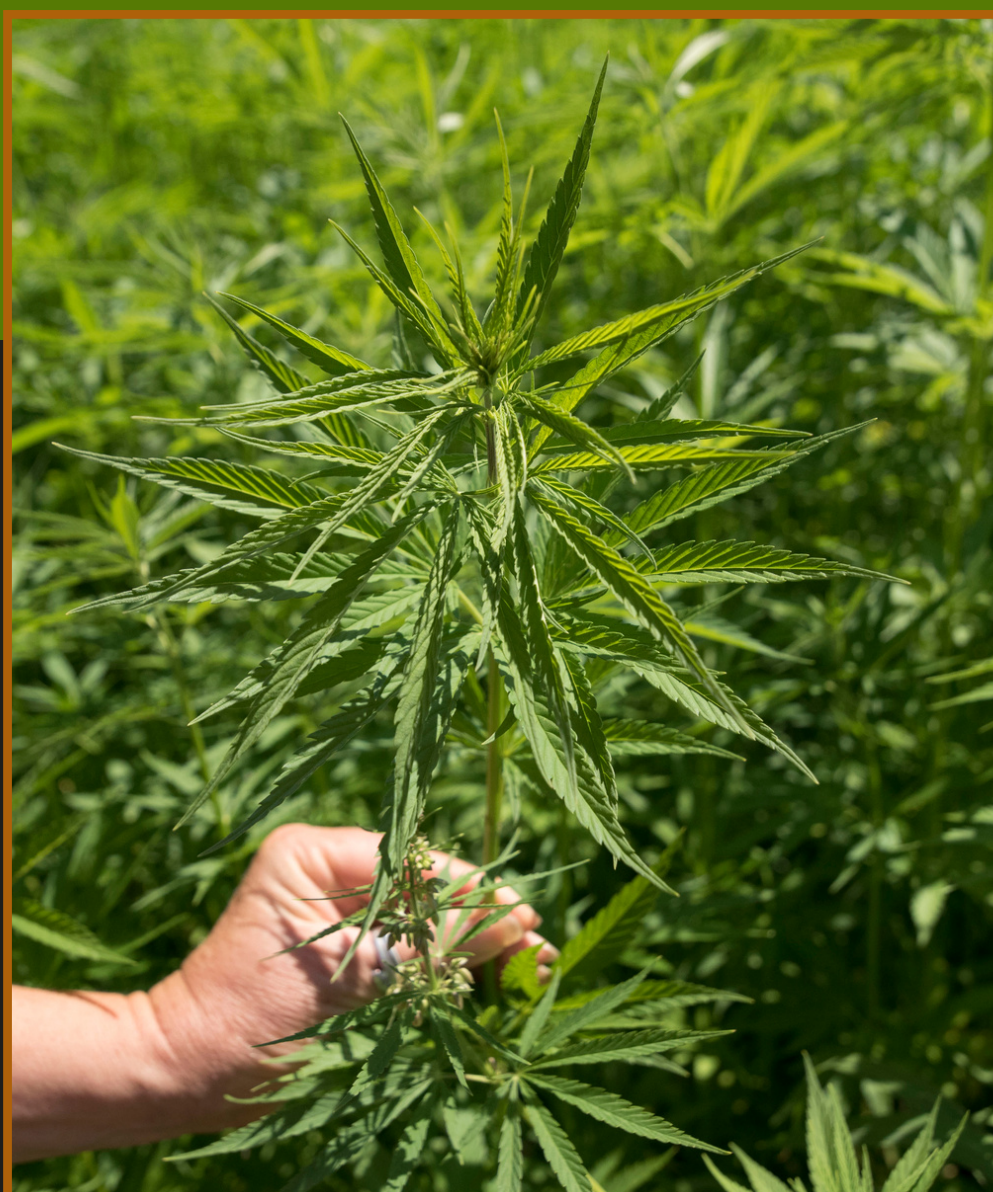
THE MIRACLE PLANT

Direct from our farm to your fork, we are proud to launch our incredibly nutritious Super food products; Hemp Hearts and Milled Hemp to the Irish market with SuperValu in September 2023.